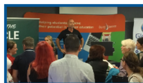
barrybennett - Ireland