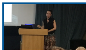
Iansyst - Bristol