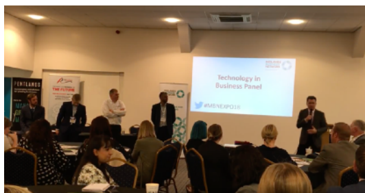
KAZ speaking at the Midlands Business Expo

KAZ were invited to speak at the Midlands Business Expo.