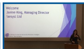
Iansyst - Moller Centre

KAZ were invited to speak at the Midlands Business Expo.