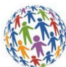
BDA International Conference and EXPO 2018

April 2018 - Supporting the BDA International Conference and Expo